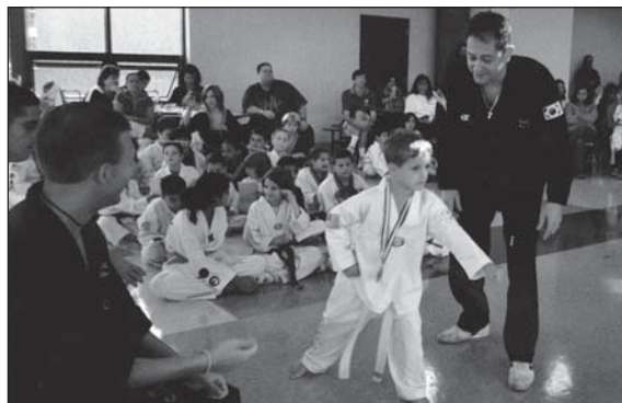
Young athletes perform to raise money for pre-schoolers.

Pre-schoolers with disabilities joined students from United Martial Arts Centers ( www.umacenters.com ) for a Kickathon and Championship Exhibition that raised $10,000 for Westchester ARC's Children's School for Early Development. Over 100 people attended