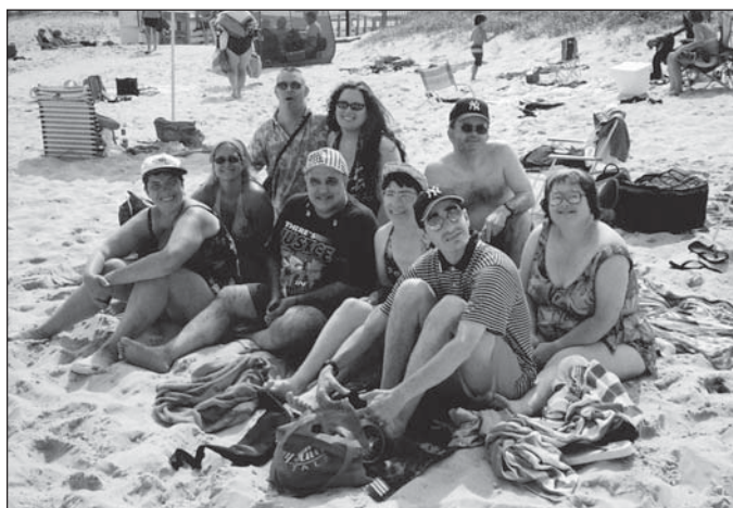
On the beach in Seaside Heights.