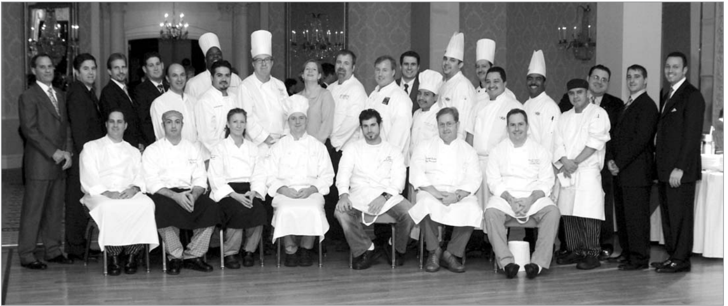
Seventeen of Westchester County's top restaurants donated expertise and food to the agency's second annual gourmet gala.