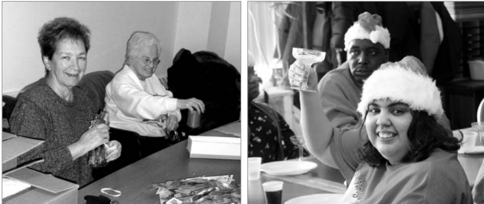
Agency-wide, Westchester Arc got into the holiday spirit: Volunteers in the Northern League sponsored a celebration at the Ann Manzi Center in Mount Kisco, and guardianship held its annual party at the Westchester Marriott in Tarrytown. Day habilitation held a holiday cookie contest that brought out consumers' creativity, while successful food and toy drives collected goods for local families in need.