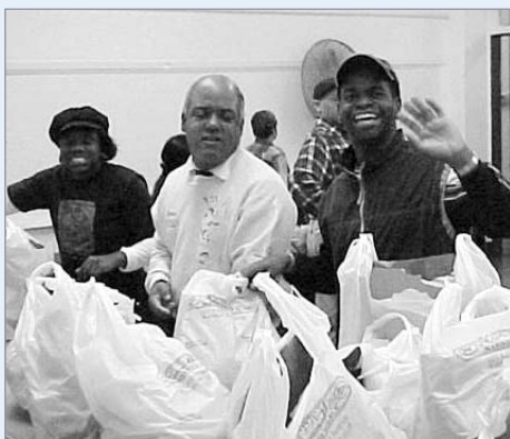
Self-advocates decided to volunteer at a local food pantry

Last July, when individuals in the Yonkers pre-vocational program desired work in the community, employment spe-