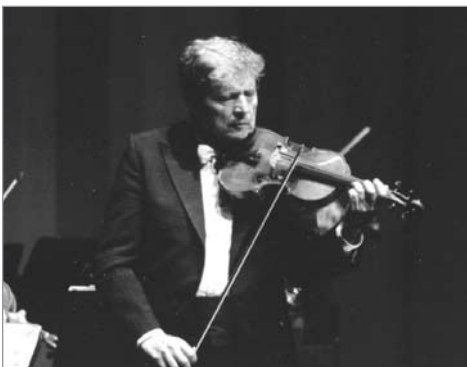
Maestro Ughi performs in honor of people with developmental disabilities.

Driven by a desire to help children and adults with developmental disabilities, internationally acclaimed violinist Uto Ughi gave a rare United States performance on November 13. Held at the Performing Arts Center in Purchase, New York, "Homage to Umbria" raised $100,000 for the Westchester Arc Foundation and paid tribute to Americans of Italian origin. The concert was organized by the Italian prime minister's office and sponsored by various Italian corporations.