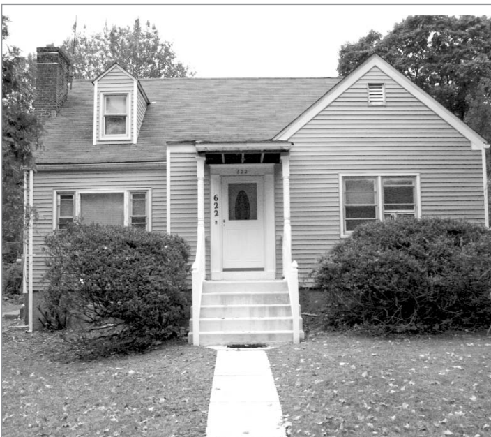
The newly renovated Respite House.

Sixty-five guests attended a December 3 house-warming that marked the re-opening of Westchester Arc's Respite House in Thornwood, which had undergone a six-month renovation.