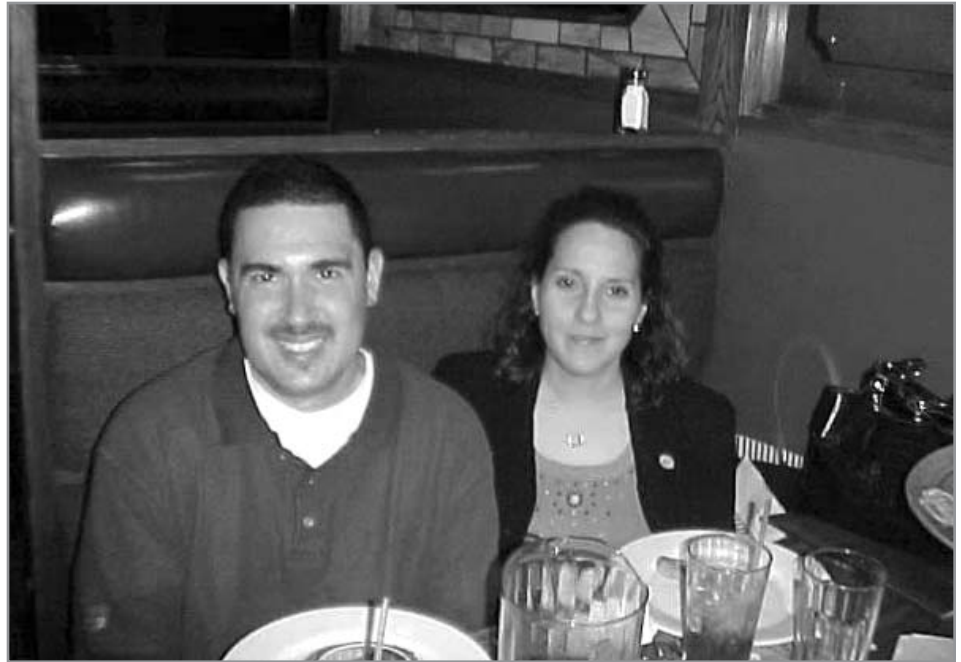
Job Clubs help individuals working in the community stay in touch with friends.

Westchester Arc's Yonkers and Mount Kisco Job Clubs help consumers who have moved from a workshop setting to community-based employment stay in touch with one another.