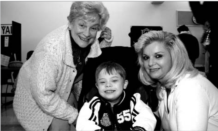
Three generations turn out for Westchester Arc's second Family Resource Day.