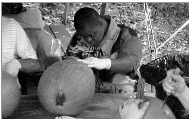
Westchester Arc provided more volunteers than any other participating organization.

The activity helped individuals build motor and teamwork skills and encouraged creative thinking. "I had so much fun volunteering for this event,"