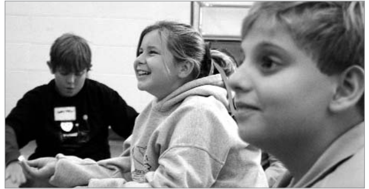
At Sibshop, kids discuss having a family member with a disability.

On Saturday, October 1, Westchester Arc and community partners tackled a wide array of problems facing the families of people with developmental disabilities. One hundred fifty children and adults attended the agency's second Family Resource Day, held at White Plains High School. Experts addressed controversial New York State laws relating to sexual rights; the challenges to family life when a member has autism; how to "work the system" to obtain the best education possible for a child with disabilities, and much more.