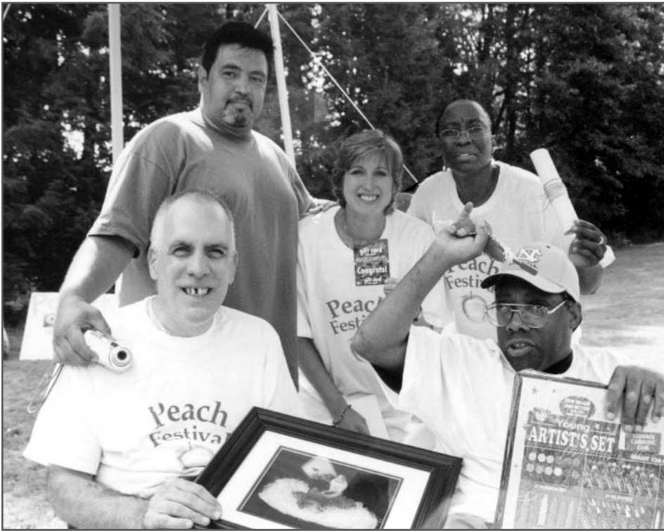
Over 70 people attended day habilitation's peach festival.