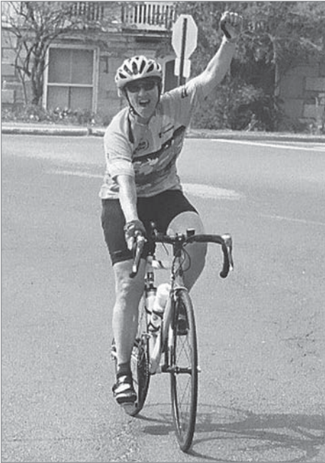
Bicyclists overcame bad weather and daunting terrain.

Fifty-four cyclists peddled from New York to Vermont on June 10-12 for the annual Tour de Bresnan, raising over $200,000 for Westchester Arc and Special Olympics New York-Hudson Valley Region.