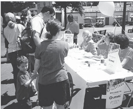
Supporters enjoy a day at Rye Playland.

Students from United Martial Arts Centers ( www.umacenters.com ) raised $4,000 for Westchester Arc's Children's School for Early Development at a June 4 Kickathon and Family Fun Day. Over 100 people attended the event, held at Rye Playland Amusement Park. After the "Kickathon," donors spent the day riding the Dragon coaster, ferris wheel, Old Mill and other Playland attractions.