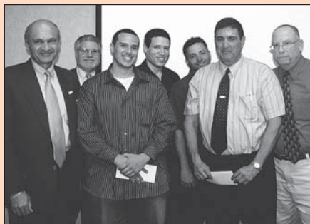
Second prize went for a creative solution to the bus strike challenge.

The agency's Best Practice Awards, presented twice a year, recognize the staff's innovative and caring approaches to enriching the lives of individuals with developmental disabilities. The latest winners are: