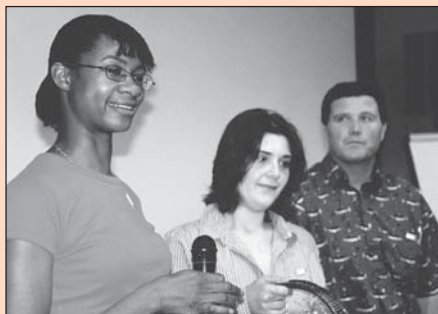
Staff involved day hab attendees in a pet treat project.