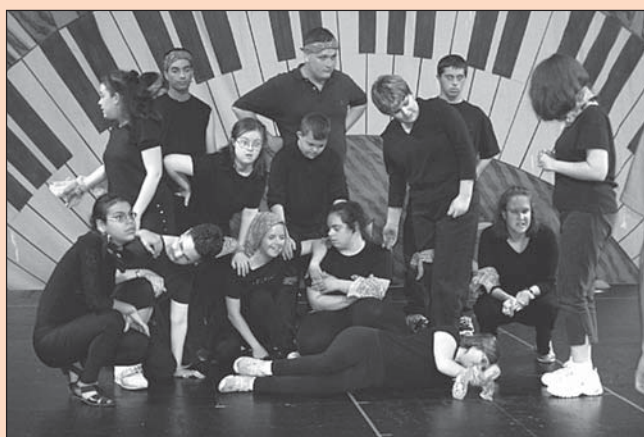
Young performers wow the audience.

“Echo Onstage serves a rapidly growing group within the Westchester Arc “family,”